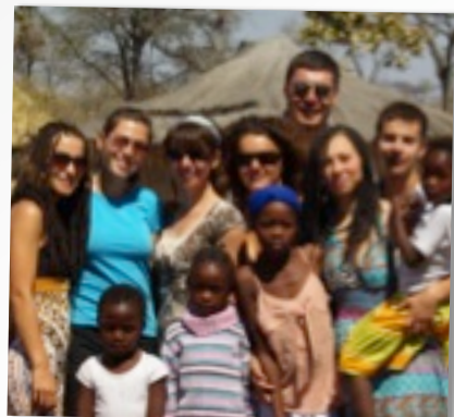
YOUNG PEOPLE AND LOCALS